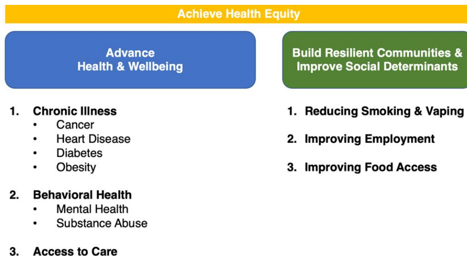
Figure 3. CHRISTUS St. Michael Health System Priority Areas